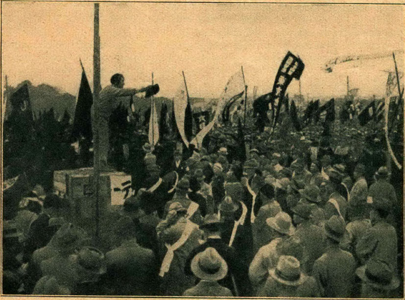
Japanese revolutionist addressing anti-war meeting in Tokio.

The United States is, however driving ahead for the mastery of China. It is striving to unite China, or a considerable part of it, under the bourgeois Nanking Government of China, in order, through that Government, to convert the whole of China into its colony.