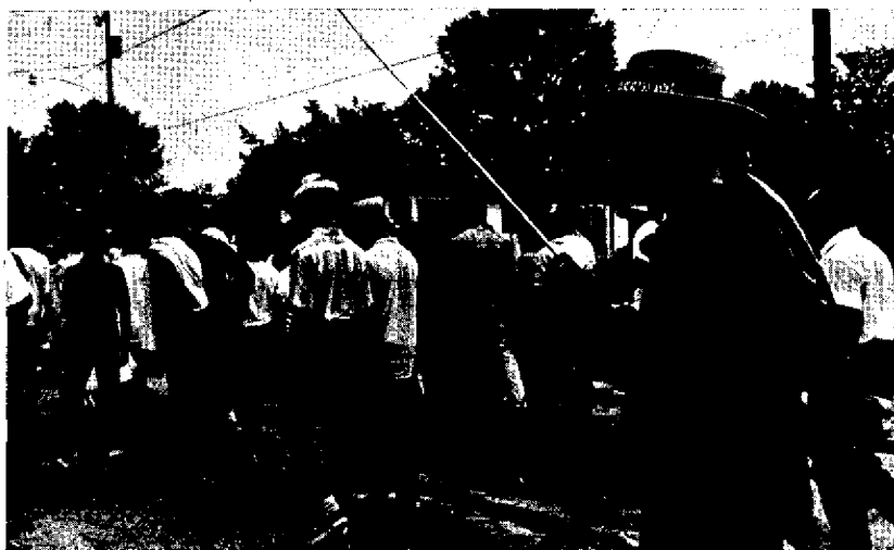
Communication system is part of Deacons' gear. During marches, walkie-talkies were used to report any incidents to organization's far-flung patrols. As demonstrations passed through white area, some Deacons mingled with crowd, others waited in cars.

The Deacons for Defense signify a major development within our struggle. For the first time since 1958 black working class leadership expounding and practicing self-defense has emerged. With over 15,000 members the Deacons are definitely a force to be dealt with. Self-defense changes the whole character of our movement and allows other questions to be raised. Self-defense introduces the concept of a black liberation army for protection and survival. This in return raises the question for every black man in America: "Should I join or support charlies' army or the black liberation army (Deacons)?" This is the historical question of the hour. For our people to understand this question, our movement must become anti-imperialist-anti-U.S. racist government. Therefore, the next step in our struggle is to develop a black anti-imperialist movement. These questions were dealt with during the May 1st and October 30th Conferences. Since both conferences, we have consolidated and developed many of our objectives. In order to intensify the quality of our ranks REVOLUTIONARY NATIONALIST feels it necessary to discuss para-military warfare, Robert Williams' concept of urban guerrilla warfare, etc, We feel that these articles may help in the next step and the road ahead.