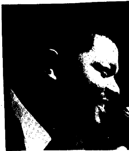
The Coming of Massive Violence