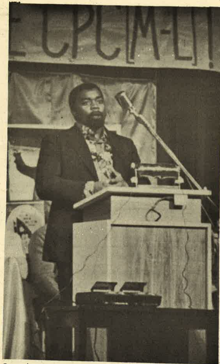
Comrade Jorge Sangumba, Foreign Minister of UNITA.