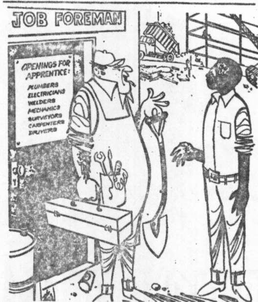
"First, take 20 years and learn this intricate tool."