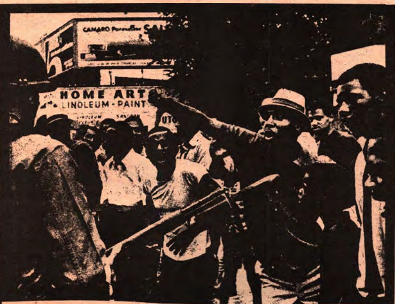
"They throw away the mask of 'democracy', of 'fairness', of 'human rights', and resort to ruling the people through naked and unrestrained force."

The winds of revolution are blowing throughout the ghettos and barrios, the factories and workshops, across the docks and railroads, into the mines and oil fields, the working class is awakening like a powerful giant, proud and defiant we stand as one man. Indeed, the working man has no country -- we are determined!