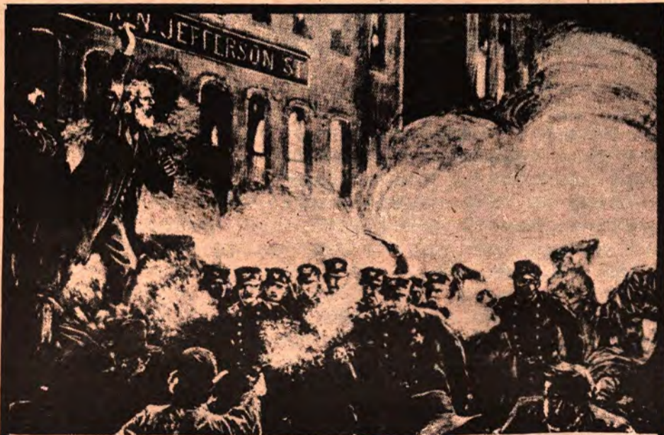
"In Haymarket Square for the 8 hour day ..."

In Haymarket Square for the eight hour day, the workers stood firm in open defiance to the capitalists and their state. The police attacked again and again casualties mounted but the workers did not waver for theirs is a strength born of suffering and want determined they stood and determined they fought on they fought for the right to a union from coal mines in Virginia to the farmland of California from the steel plants of Pennsylvania to the auto industry in Detroit Open warfare was declared with the oppressors in one camp and the oppressed in the other the unions were won with courage and boldness paid in blood, sweat and tears. Our eyes were opened by those who saw far ahead that revolution is the only way we'd really be free and betrayed by others who cared not a lick except for themselves and least of all us. But we saw who they were and realized our tasks for we have nothing to lose, A world to gain.