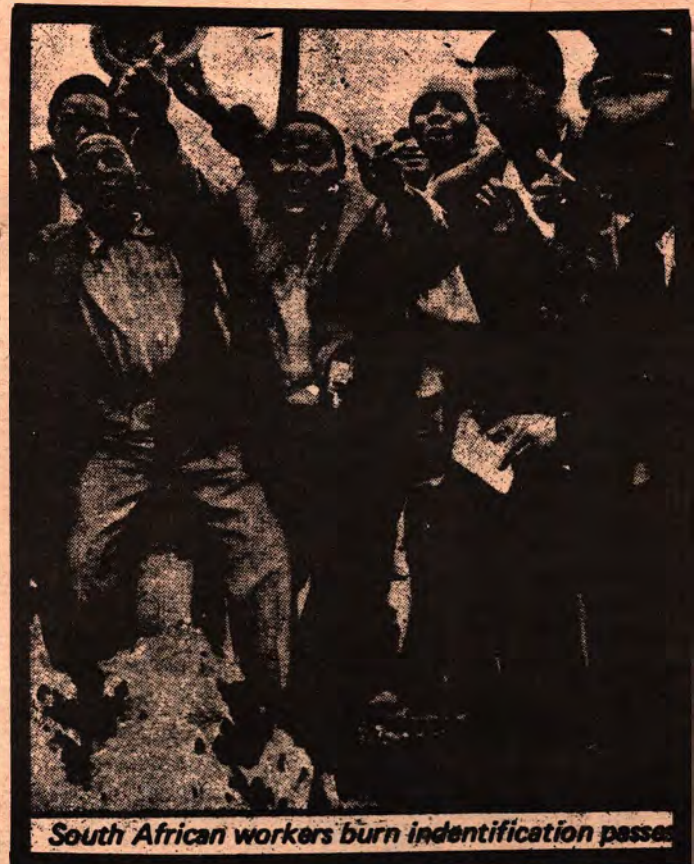
South African workers burn identification passes