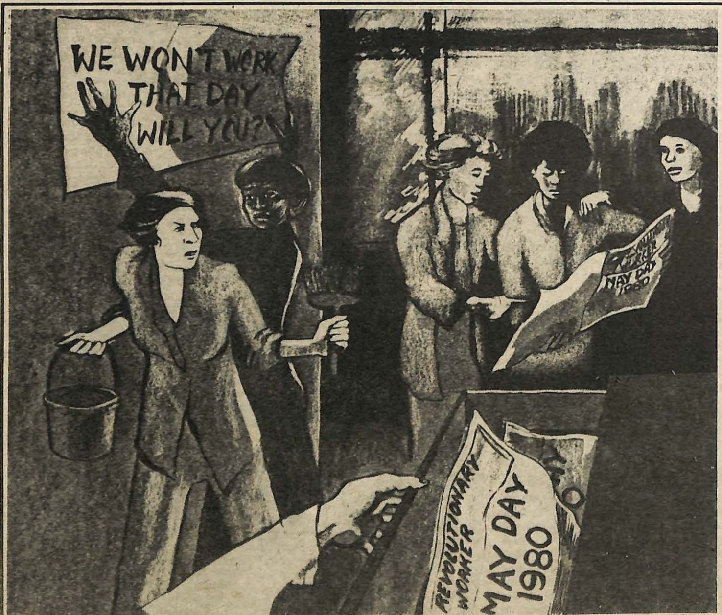
This drawing was recently received by the RW. It was inspired by an article about an RW network in a factory where workers passed the paper around by leaving copies in a drawer for the next shift to find.