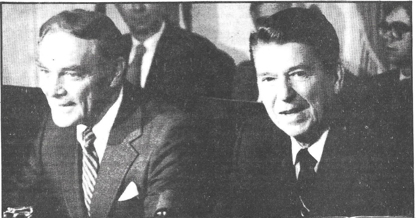
Reagan and Haig. A poor choice for the bourgeoisie, Reagan's failings have already been formalized as “cabinet government” and the appointment of Bush as “crisis manager.” And Haig is far from just a simple representative of the so-called “military-industrial complex.”

In this regard there is only one quality of Reagan's which the bourgeoisie is glad to have, but even this is a mixed blessing. This quality is intimidation at home and abroad. In the eyes of the world, Reagan is no Mr. Nice Guy, but a “Mad Bomber” — an image cultivated by Nixon — only more so. The bourgeoisie needs this and will use it to the hilt. The corollary to intimidation and redbaiting here is political and military intimidation of countries which stand up for their rights. The world knows little of Reagan the sleepy “delegater of responsibility.” It remembers Reagan's violent denunciation to any concession to Panamanian sovereignty over the Canal Zone. It remembers the many times Reagan has called for military intervention — in Angola, Zimbabwe, Nicaragua, Iran and even Peru. The billionaires hope to use this subjective factor to instill fear in the movements for national liberation in the third world. They hope to use it — as Nixon did — to gain an advantage in negotiations.