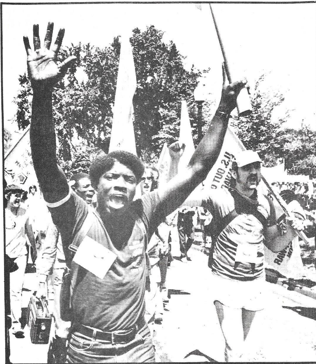
May 3rd demonstration in Washington, D.C. The hundred thousand people on May 3 brought out a hell of a shade in the government's "human rights" policy — mass resistance to direct intervention in the third world.

personally wrote a letter to Carter, urging him not to send military aid. A month later, he was assassinated while conducting mass. At his funeral, attended by clergy from all over the world, government troops ambushed and fired into the crowd of mourners. By 1980's end, more than 13,000 people had died as a result of this campaign of terror by the government. The indiscriminate murder of peasants, lawyers, engineers and priests, and the growing list of missing persons kidnapped by government troops have sickened everyone and turned the whole country against the government. As a Salvadoran working in a refugee center said, "The only solution left to us, after everything else we have tried has failed, is the road we are following right now — all the people making the revolution, everybody is joining the revolution. Even those who didn't want to believe in it. Because people are willing to make any sacrifice, even to die, so the rest of us can live in a better world."