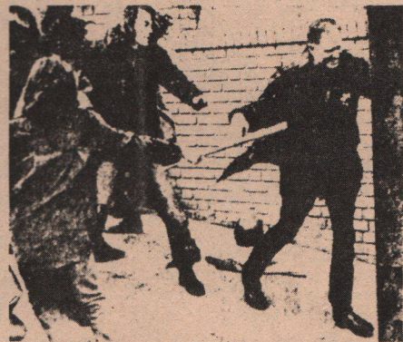
SEVERAL PROGRESSIVE YOUTH REPLY TO THE COUNTER-REVOLUTIONARY VIOLENCE OF THE MONOPOLY CAPITALISTS WITH REVOLUTIONARY VIOLENCE OF THE PROLETARIAT AND OPPRESSED PEOPLE. ON DEC. 1, THE HITLERITE FASCIST KY, NOTORIOUS TRAITOR TO THE VIETNAMESE PEOPLE, SPOKE IN SAN FRANCISCO. 7,500 OF THE REVOLUTIONARY MASSES ROSE UP TO DENOUNCE HIM AND FIGHT VALIANTLY WITH THE 350 FASCIST POLICE CALLED OUT TO PROTECT THIS ADMITTED NAZI.