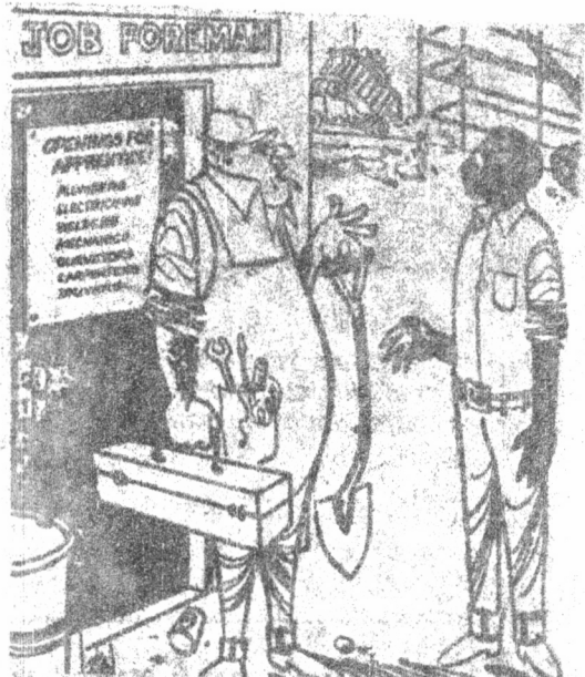
"First, take 20 years and learn this intricate tool."

Many workers have commented on the discrimination against women at GLS. During these lay-offs it seems like all the women are sent to the Sinter Plant. Now everyone knows that the Sinter Plant is the dirtiest, nastiest place in the whole plant. The Consent Decree was supposed to end discrimination against Negro, Mexican and women workers, This kind of back door discrimination by department should be stopped. Why isn't the Civil Rights Committee doing anything about this? "Equal pay for equal work" is supposed to mean just that - not "less pay for worse work"!