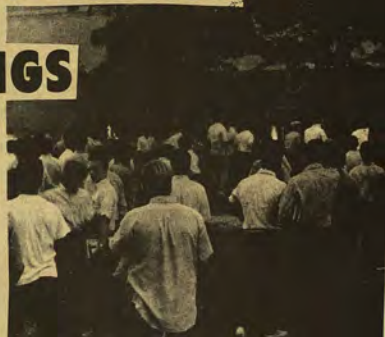
PUERTO RICAN students fight ROTC - 1971

SDS AND OTHERS ARE ORGANIZING massive MAY DAY marches in WASHINGTON, D.C., LOS ANGELES, TORONTO, SEATTLE/VANCOUVER and HOUSTON. THE DATE: April 29th. OUR PURPOSE: to oppose the U.S. war; to fight racism, especially on campus; to call for (and in the demonstrations themselves, put into practice!) worker-student alliance; to issue a living call for unity in struggle among workers and students here and AROUND THE WORLD. International solidarity is the keynote of this action! THIS IS AN ANTI-WAR MARCH which links the war to the terrible oppression of working people here and around the world, especially non-white. It supports those who fight back. It puts the blame where it belongs on the U.S. government and other oppressors. It accuses the U.S. government of war crimes and racist crimes. Right now the U.S. government is giving millions in Vietnam a taste of ITS kind of "solidarity" - bombs to try and crush their struggle. Let's get together - thousands of us - and celebrate MAY DAY in WASHINGTON, D.C., LOS ANGELES, TORONTO, SEATTLE/VANCOUVER and HOUSTON and give the U.S. government a sample of OUR idea of INTERNATIONAL SOLIDARITY. An injury to one person in Vietnam is an injury to us all! Demonstrate against the racist war criminals. Marches through working class areas followed by meetings with speakers and skits.