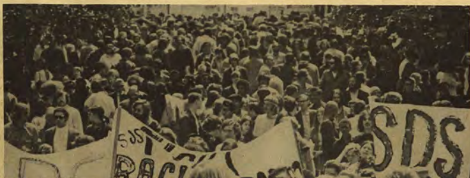
STUDENT strike, Berkeley - 1970