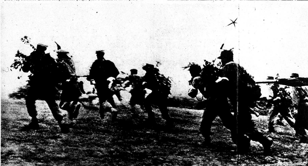
(LEFT) The Laotian People's Liberation Army give full play to their style of fighting - courage in battle, no fear of difficulties, no fear of sacrifice. They are advancing to strike blows at the enemy in the wake of a new victory.