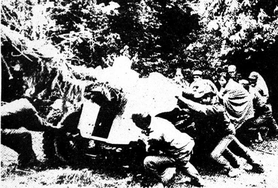
United as one with the Vietnamese and Cambodian peoples, the heroic Laotian people score one victory after another in dealing heavy blows to U.S. aggressors. (ABOVE) Patriotic Laotian armymen and people push a cannon to an outpost.