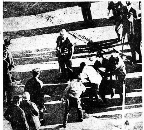
Fascist New York police attacking protesting prisoners. The bourgeois press confessed that these black prisoners were attacked after they surrendered.

This is the latest of a series of rebellions by people held in the fascist US jails. Fierce resistance to the Hitler type treatment has been consistently led by the Afro-American and Mexican-American people. This indicates a significant new development in the resistance movement of the American people to U. S. imperialist repression and it is an indication of the rapid disintegration of the whole bourgeois legal system.