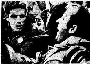
Above: Comrade Cruise militantly confronts a reactionary agent for attacking our comrades at a demonstration in October 1969. The agent (right) looks very frightened.