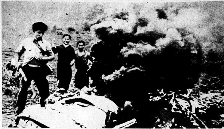
At about the same time as the wanton invasion of Cambodia, the U.S. imperialists also intensified its war escalation in Laos and use of a modern airforce to make savage raids on the liberated zone of Laos and openly use Thailand troops in its aggression. (ABOVE) Wreckage of U.S. pirate aircraft shot down with rifles by militiamen in the Laotian liberated area.