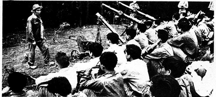
(ABOVE) The Laotian People's Liberation Army carries out political education. Fighters of a People's Liberation Army unit are listening to a poor peasant denouncing the towering crimes committed against the Laotian people by the imperialist invaders.