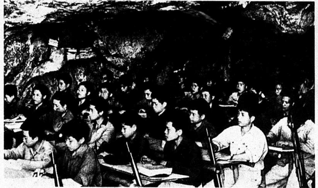
(ABOVE) Young people in the Laotian liberated areas study politics and culture diligently, using the time between battles.