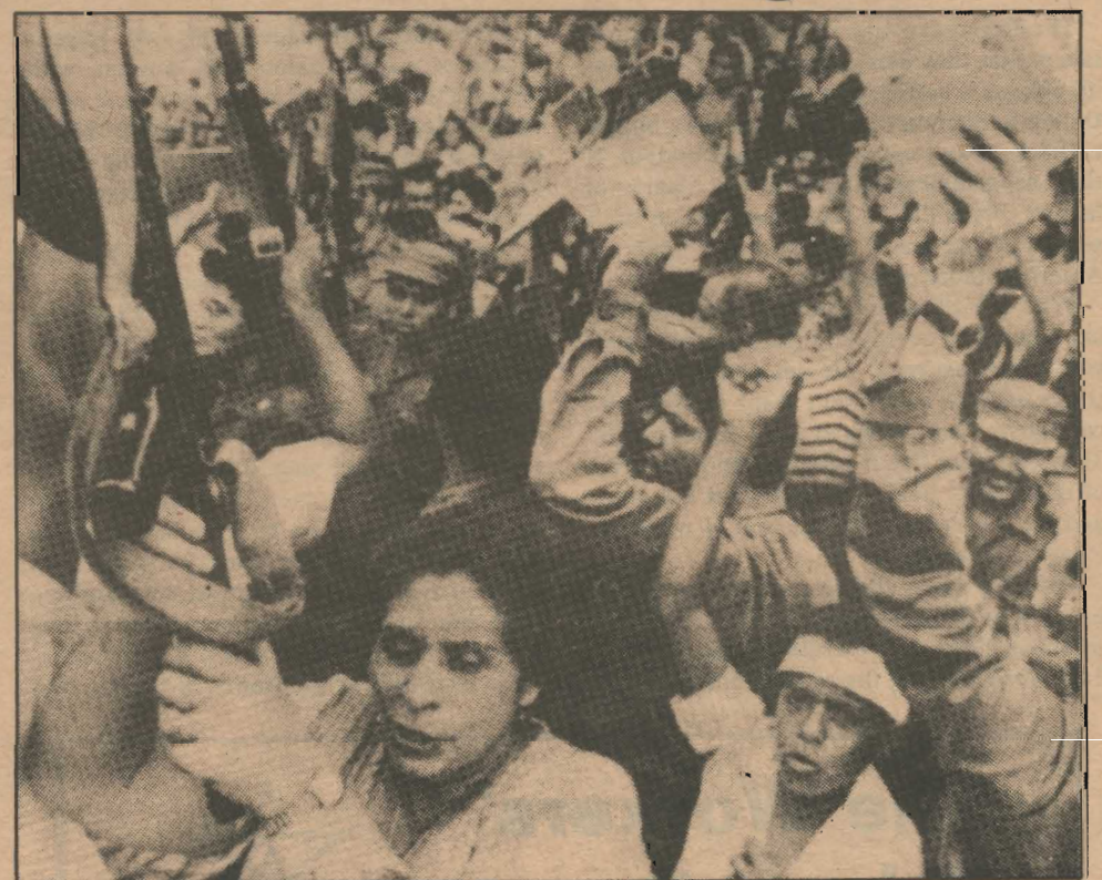
Nicaraguan masses show their determination to fight to the end! should U.S. imperialism launch a full-scale invasion.

The apologists for the Democratic Party say that Mondale will be different. At the