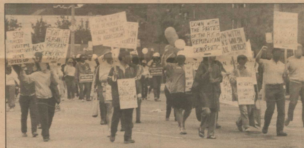
At this year's Labor Day march in Detroit, the MLP denounced both capitalist parties and called for fighting the capitalist offensive of hunger, racism and war. Meanwhile the labor bureaucrats boosted the Democratic Party ticket.

The fight against the racist drive of the