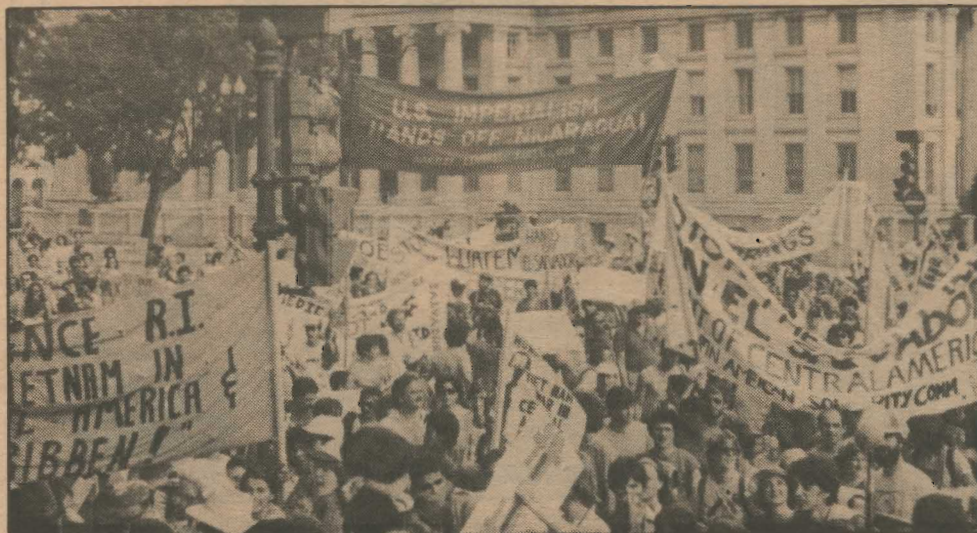
Nine thousand people marched in Washington, D.C., on July 2, 1983 to protest U.S. imperialist aggression in Central America.

against Reaganism, not playacting. This is why it is inevitable that fighting organization of the workers, separate from and against the capitalists and their parties, is bound to grow. And the workers will give rise to new militants from their ranks, to replace the scabs and bureaucrats who today style themselves "labor leaders." □