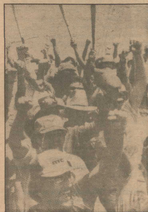
During a fierce strike against concessions, copper workers celebrate a victory over the strikebreaking of Phelps-Dodge corporation, early August, 1983.

The trade union bureaucrats are friends of the capitalists. They are against the class struggle of the workers, whether it is the struggle for wages and benefits, for job se-