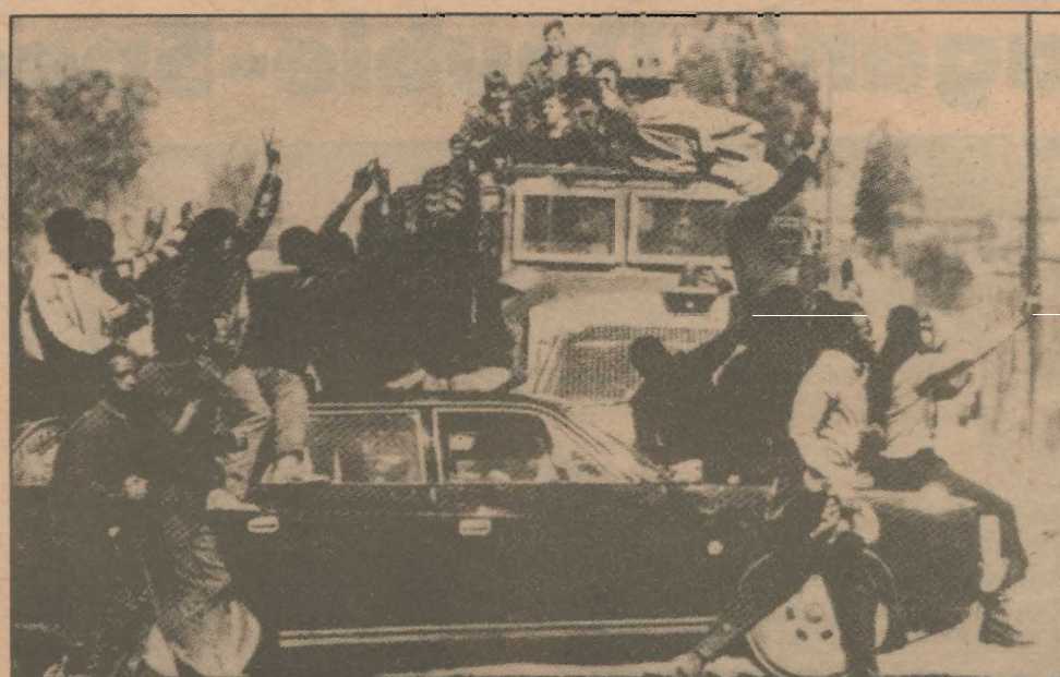
This funeral procession, outside of Johannesburg in September, became a protest against apartheid racism. The demonstrators flash defiant victory signs against a convoy of South African police.

This new constitution created a parliament of three chambers — one each for the whites, the coloreds and the Indians. There was not even the pretense of granting token representation to the black majority, 73% of the population. As well, the "representation" given to the coloreds and Indians was fraudulent through and through. Their parliamentary chambers are really only advisory bodies, lacking real power. They can only