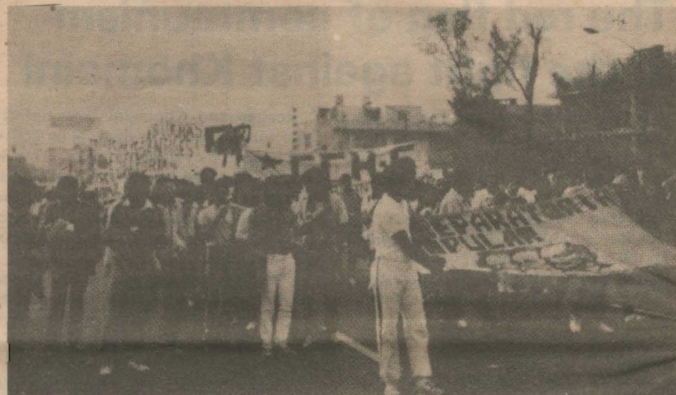
High school students in Mexico City march in support of striking utility workers.

Hard on the heels of the recent student strike at the National Autonomous University in Mexico City, some large strikes have broken out in Mexico. The Mexican workers are striking to defend their livelihood in the face of ruinous inflation and the austerity drive of the government.