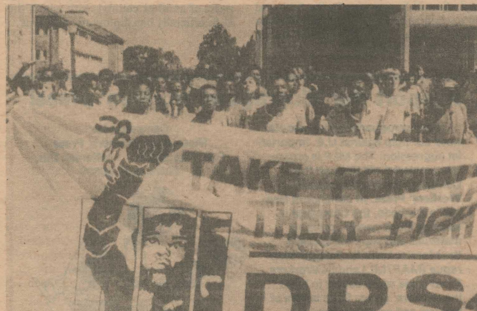
University of Cape Town students protest on National Detainees Day, March 12.

The failure of the "state of emergency" to cool things off shows the strength of the liberation movement. Moreover, it should be remembered that the news blackout has eliminated most news of the struggle. But even the little news that leaks out shows that the struggle is paving the way for the revolutionary downfall of apartheid and the entire system of white racist rule. Revolution yes! Apartheid no! □