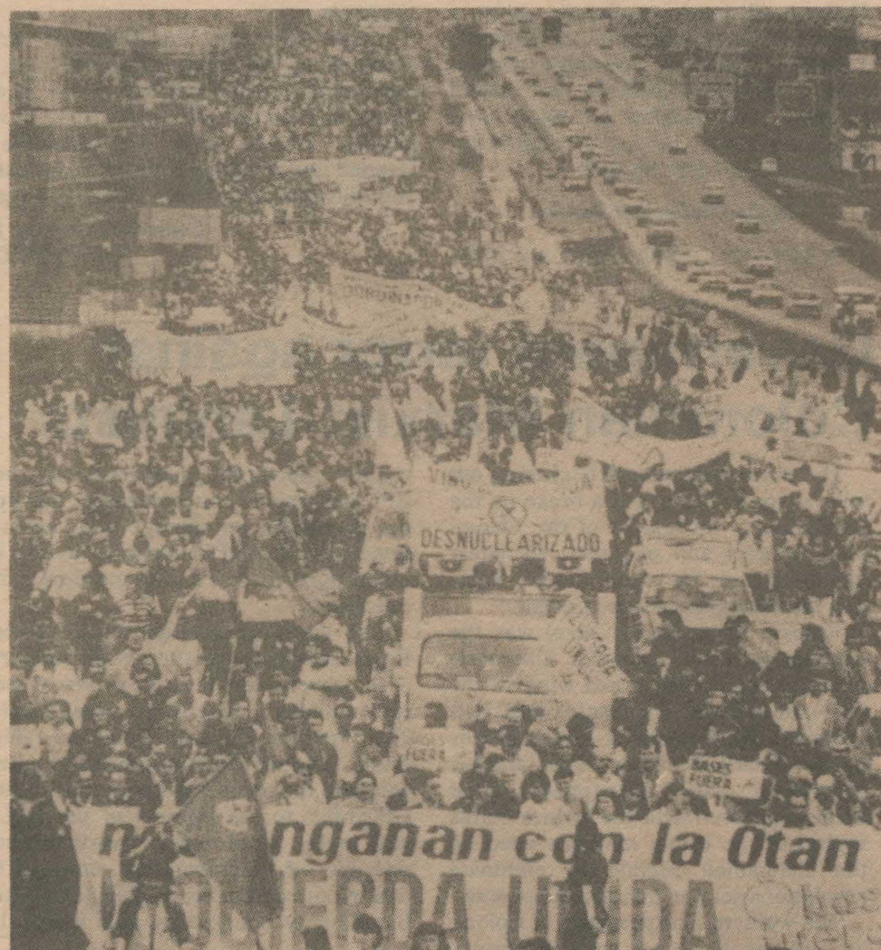
50,000 demonstrators march in Madrid against U.S. military bases and Spain's participation in NATO.