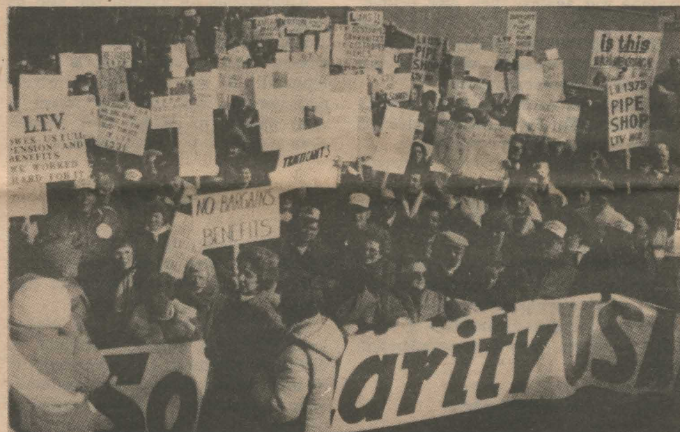
LTV retirees march on the Capitol in Washington DC, March 10.

Retired workers from LTV are fighting to restore their pensions and to protect their medical insurance. In January, LTV used the pretext of Chapter 11 bankruptcy to dump their three largest pension funds — covering 60,000 retirees — onto the Pension Benefit Guarantee Corporation. This has meant the saving of $2.3 billion for the LTV steel bosses and the slashing of thousands of retirees' benefits by hundreds of dollars each. LTV has also been trying to stop paying health insurance for retirees.