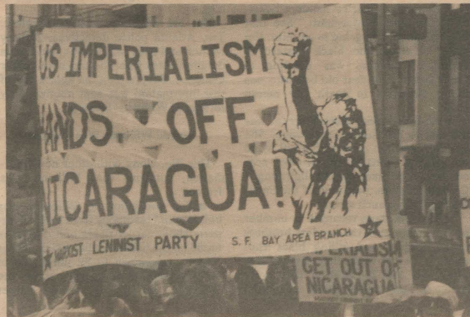
U.S. Imperialism, Hands Off Nicaragua!

The leadership of the April 25 mobilization, however, promotes reliance on the Democrats as the answer to Reaganism. This is a dead-end road. But despite this official focus, the Marxist-Leninist Party holds that workers and activists should go to these actions and should raise there the banner of a militant struggle against the Reagan agenda.