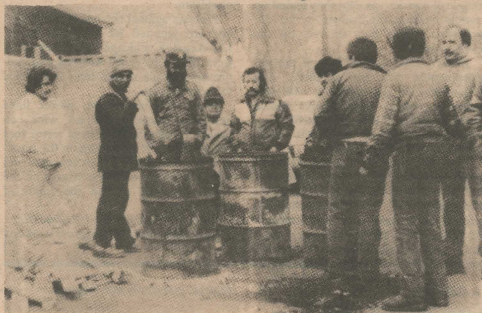
Strikers at Uretek plant in New Haven.

Sixty workers walked out of the Uretek plant in New Haven, Connecticut on February 20. Uretek produces heavy duty clothes, parachutes, gasoline tanks and other army supplies for the Pentagon.