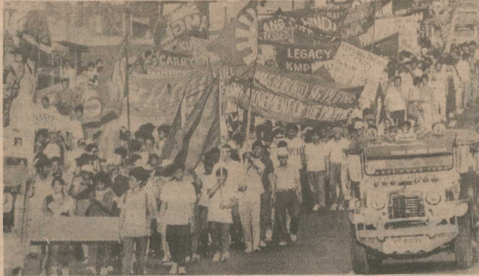
Peasants march on Aquino's presidential palace to protest her refusal to carry out land reform.

Meanwhile, the U.S. government has stepped up its demands for an upgrad-