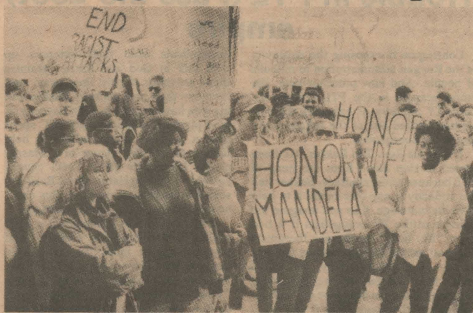
University of Michigan students rally against racism on the campus.

The truth is, the anti-racist fight is the wrong agenda for Mr. Jesse Jackson. Especially, it isn't good for his bid for the Democratic nomination for president. After all, this requires gaining the trust of the big-time political brokers, the trade union chieftains, and other died-in-the-wool racists. For this, platitudes about the economy and the environment are just the ticket.