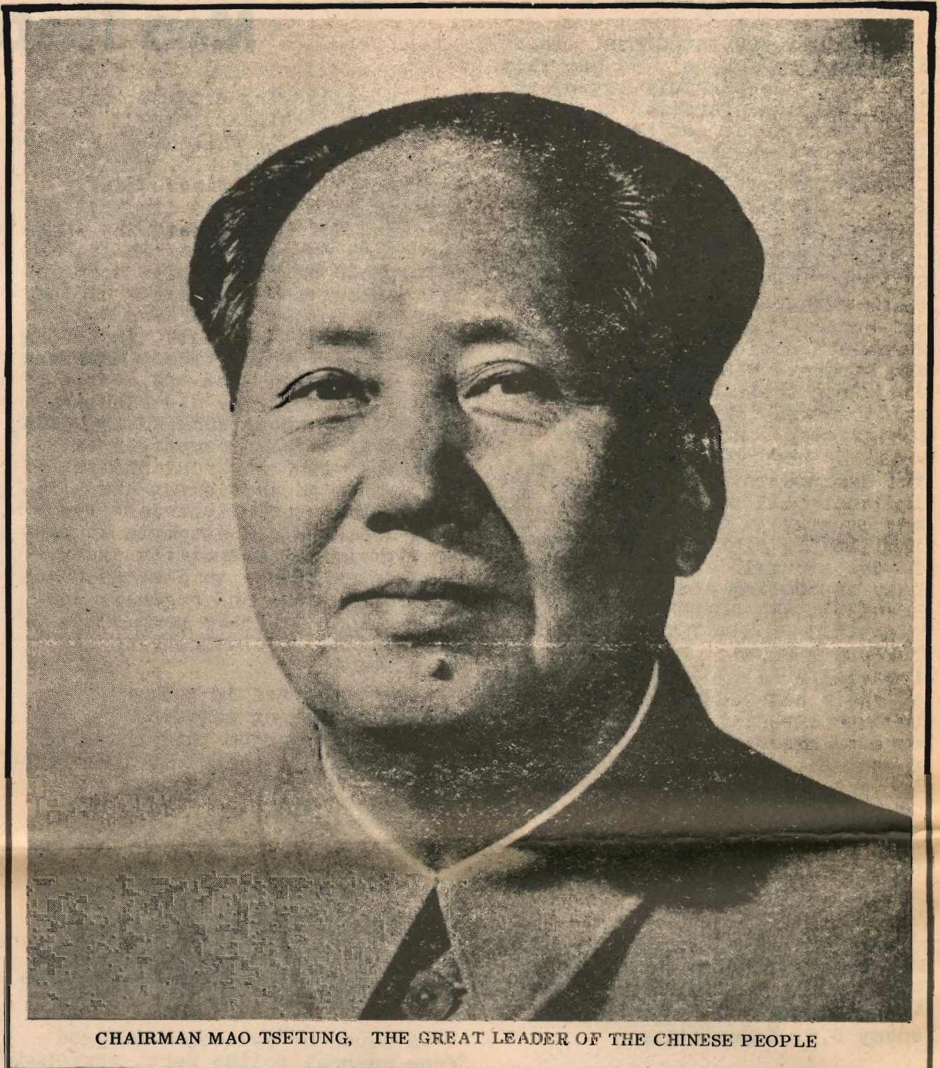
CHAIRMAN MAO TSETUNG, THE GREAT LEADER OF THE CHINESE PEOPLE

The developments in the domestic and international situation helped us understand more deeply that "the current Great Proletarian Cultural Revolution is absolutely necessary and most timely for consolidating the dictatorship of the proletariat, preventing capitalist restoration and building socialism." The monsters and freaks who made every attempt to undermine this great revolution and the heroes who even in their dreams want to turn China into their colony have been mercilessly ridiculed by history.