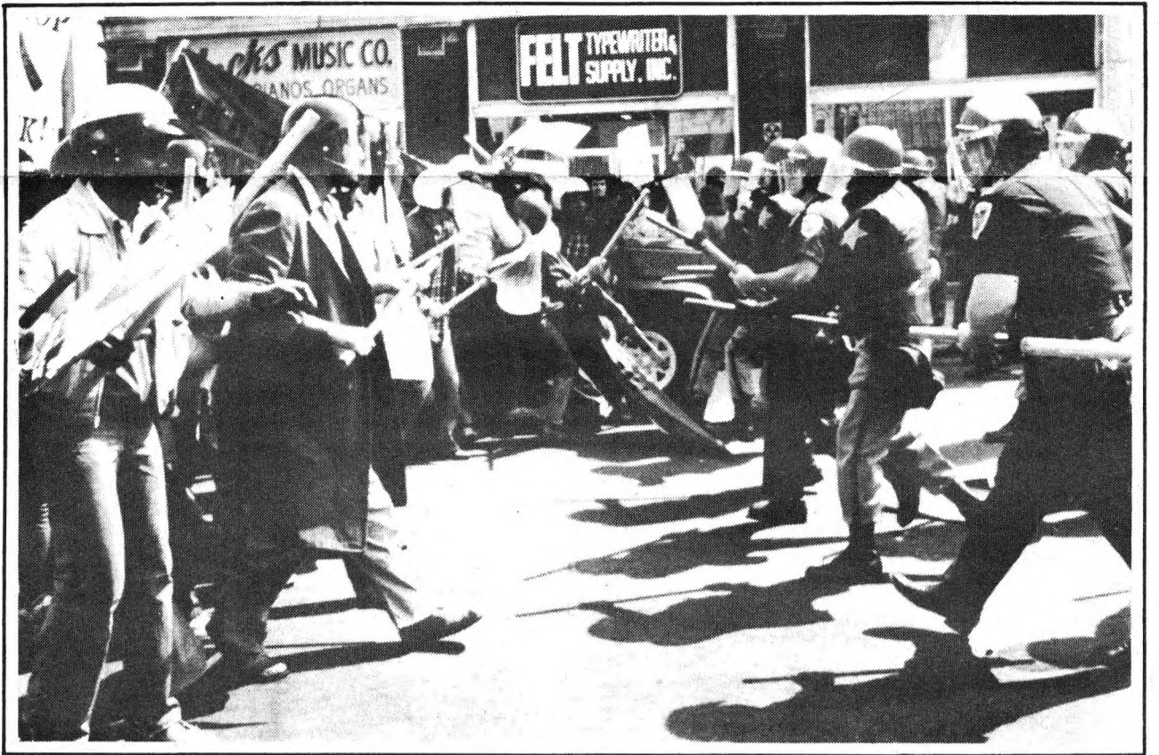
March 26—In the front ranks of the anti-Klan march, CWP fighters stood off the Kokomo police riot squad and protected demonstrators.

preparation for the dictatorship of the proletariat a thousand fold. There is no question that the Afro-American masses will step forward and embrace communism, particularly the CWP on a mass scale in the 80's, as proven at the funeral march for the CWP 5 and on Feb.