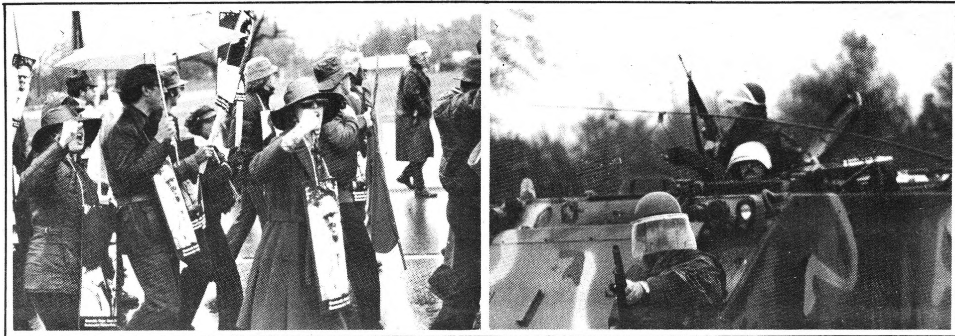
On Nov. 11, in honor of our five comrades murdered by Klan/Nazis/FBI armed funeral marches defied the military might of the state.