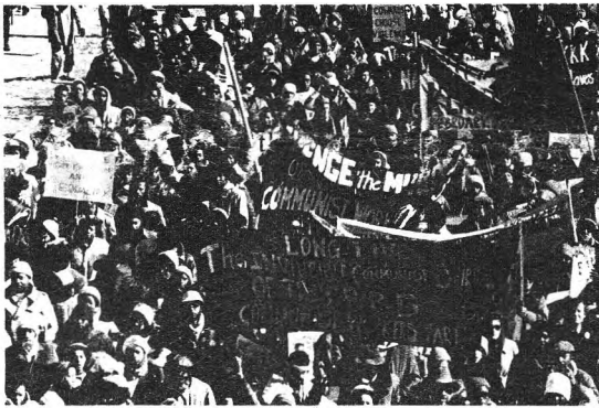
Marchers demonstrate against the Ku Klux Klan at a Feb. 2 rally.

On November 3 last year five members of the Communist Workers Party (CWP) were shot and killed by Klan members and self-professed Nazis during a demonstration in Greensboro, N.C. that was billed as a "Death to the Klan" rally. Arriving in a caravan, the Klansmen opened fire on the group of protesting Blacks and Whites, who reportedly had hurled anti-Klan slogans and pelted on the cars when they drove into the Black neighborhood.