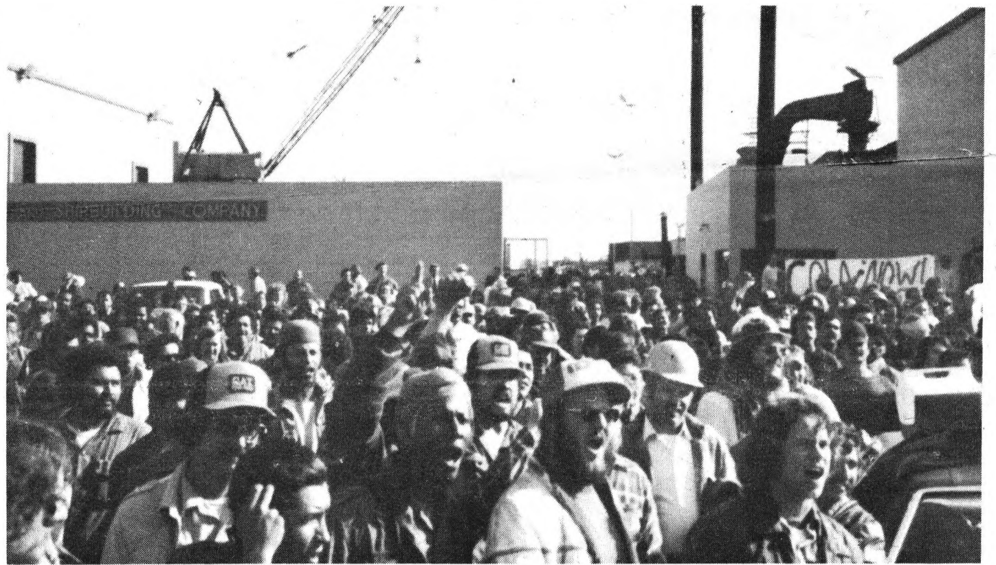
On March 27 Nassco shipyard workers in San Diego flooded the yard for a union rally demanding COLA. On April 1 they followed up with a sickout by 900 workers, part of a campaign led by CWP supporters.

herent understanding, strategic class confidence and a clear target to the workers. We must explain to the masses why the 80's economic crisis is deeper than the 30's Depression and what this means for the immediate prospects for proletarian revolution. We must push this militant, communist propaganda/agitation in creative ways such as the political/military skirmish with the state/KKK last month in Kokomo, Indiana. The tasks ahead cannot be accomplished through individual campaigns, like the Nassco campaign around COLA, alone—the individual struggles must take place under the influence and in the larger context of the Party's political and theoretical leadership. The moral authority for the 80's will be shaped and can only be shaped under this line and this line alone. □