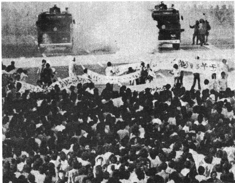
In the biggest demonstration in 15 years, over 50,000 S. Korean students battled the police and army to demand the end of martial law once and for all.

Shock waves from the recent protests of South Korean students are ripping through the country. The heroic students are inspiring the people of their oppressed land with their series of massive demonstrations against the government demanding an end to martial law once and for all. They want the changes in the fascist 1971 Constitution, democratic elections and other reforms promised by the government to be