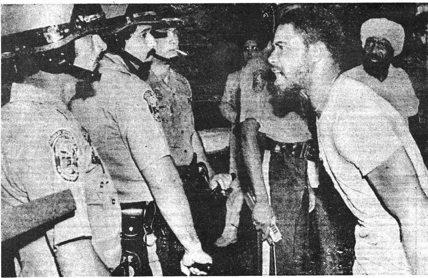
Afro-American worker curses Miami pigs during the night of the rebellion.

The decade has barely begun and Miami is at war. Miami commands the undivided attention of the entire nation, as the fury of the Afro-American people swept through the city like a raging inferno. Miami exploded in the most powerful armed rebellion since the 60's. And Miami is just the beginning, a preview of the class and national struggle to come.