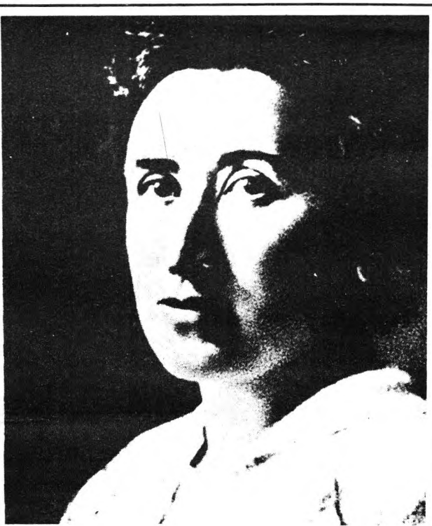
Just as Karl Liebknecht (right) and Rosa Luxemburg (left), leaders of the German Communist Party, were murdered by the Freikorps, the bourgeoisie assassinated the CWP 5 and is attacking the Party using the Klan as its spearhead for fascism.