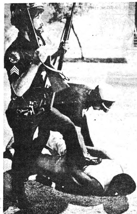
With no reforms left to try to pacify the Afro-American people, the bourgeoisie will have to crush their resistance by brutal force.

things off. And what happened? Andrew Young, Carter's number one Negro, had to admit their impotency. "When something like this gets started, there's nothing you can do." But they did do something. What these misleaders did was to try to divert the struggle of the Afro-Americans against the state, the cops and the court into a black and white, black and Cuban issue. Though mainly aimed at the cops, and the state, without communist leadership the spontaneous movement did become anti-white instead of anti-monopoly capitalist as a response to national oppression. During the first night of the rebellion, three whites passing through Liberty City were taken from their cars and beaten to death in a spontaneous outburst of the masses' anger. Fascist scums, the Klan, took the opportunity to nightridding the black community and shot at innocent people, killing three people. These dogs need to be treated like the cops—and shot on the spot. However, most whites have