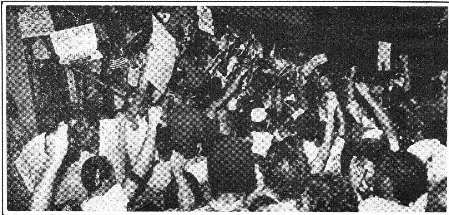
Miami. 5,000 Afro-Americans surround the justice building moments before storming the building.

The revolutionary energy and heroism that the Afro-Americans demonstrated in Miami is not enough to bring down U.S. imperialism. To overthrow the whole capitalist class, the armed struggle must be national in scope, consciously led, and well prepared for. That means 200 hundred million have to be politically educated to, and there must be hundreds of Miami's with one aim—to destroy capitalism. Preparation for that glorious day is what the Communist Workers Party is all about. □