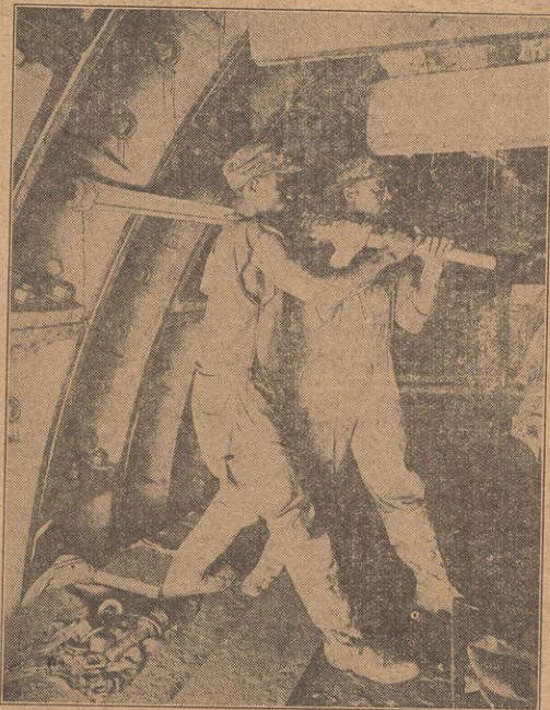
At work in the city tunnel in Chattanooga. These workers get 25 cents an hour, under unbearable speed-up, working sometimes at a 20-hour stretch. "If you don't like," says the boss, "get out." Workers fall from exhaustion at the end of the day's work. Organization and struggle is the only way out.