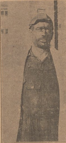
The miners at Birmingham prepare for struggle against the Tennessee Coal and Iron Co.