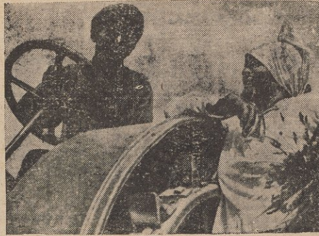
On a collective farm in Soviet Russia.