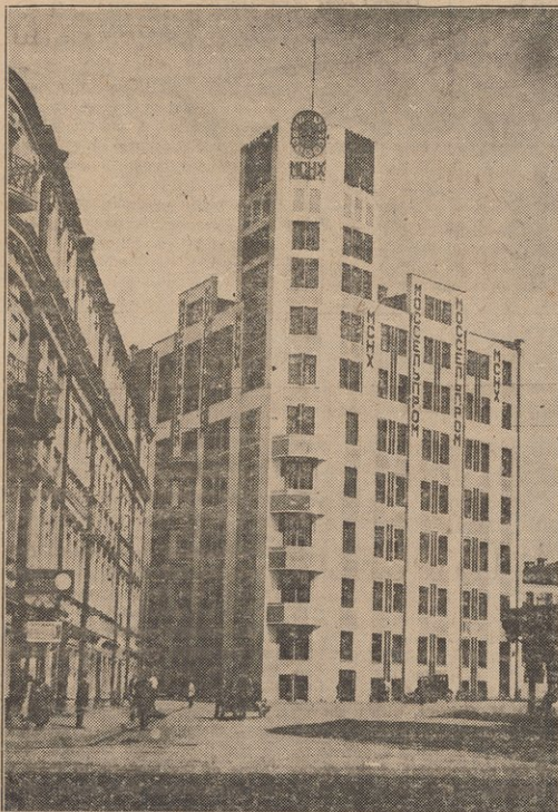
Notice the plentiful ventilation. New factory buildings like these are springing up as the 5-Year Plan progresses rapidly.