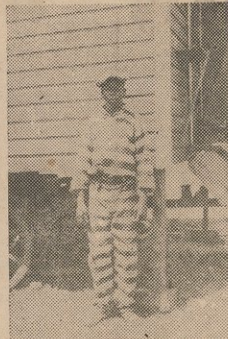
The specialty of the South's ruling class—chaingangs! Brutal and forced labor is described in the article below.