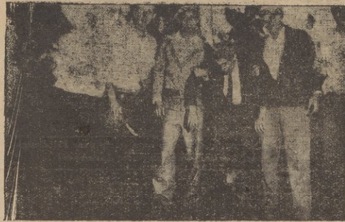
After an attack by state troopers on a picket line in the struck coal fields of Pennsylvania. Tear gas, clubs and rifle butts are used freely against the miners fighting starvation. The photo shows one striker overcome by tear gas. The miners can protect themselves from these attacks but they need food. Send all funds and food for relief to the Striking Miners' Relief Committee, 611 Penn Ave., Room 205, Pittsburgh, Pa.