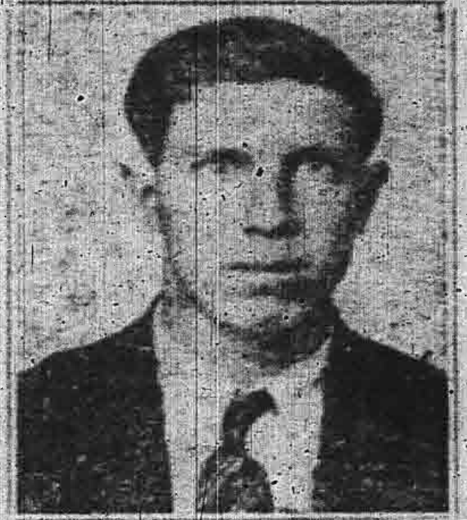
COMMUNIST CANDIDATE FOR SHERIFF