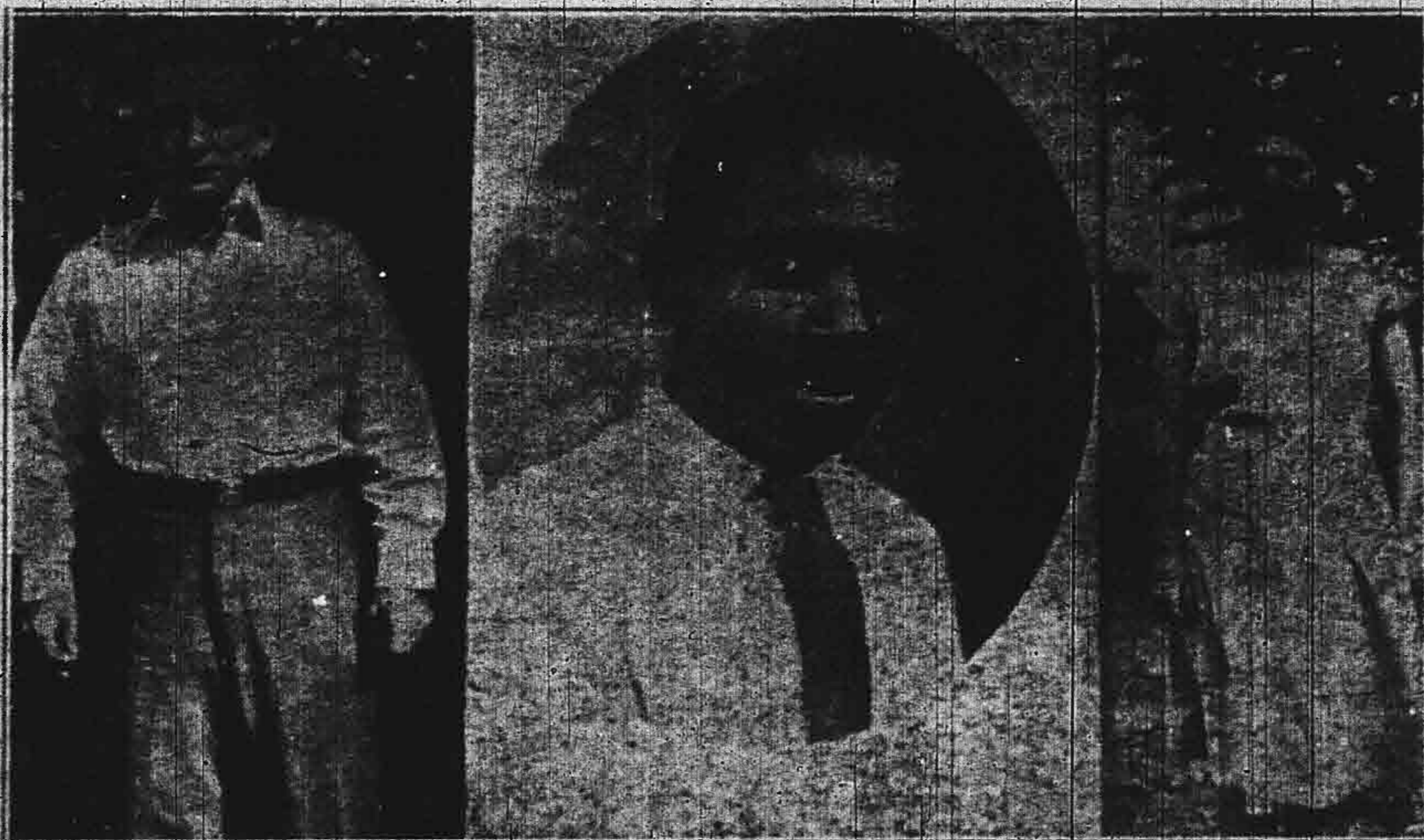
JOBLESS RELIEF, UNQUALIFIED RIGHT TO ORGANIZE, and EQUAL RIGHTS FOR NEGROES are the main demands in the platform of these three candidates for the City Commission of Birmingham. They were nominated by the workers, on the ticket of the Communist Party.