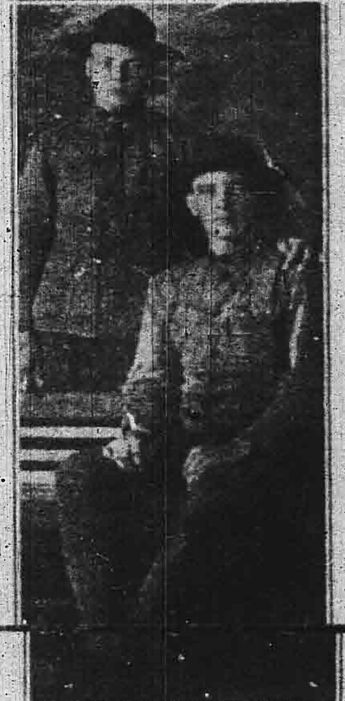
The workers of Kentucky have named a Communist election ticket in spite of terror. Two of their candidates are pictured above.